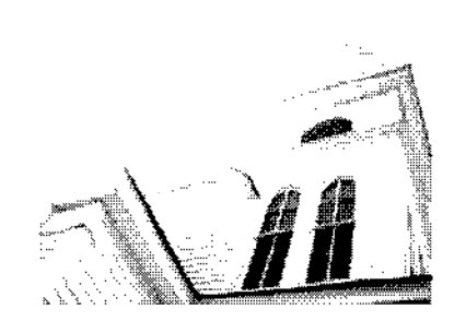
201 East Ivy Street Ellisville, Mississippi

Saved By Grace Alone. Through Faith Alone. In Christ Alone